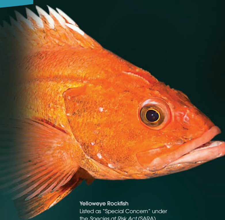
Yelloweye Rockfish Listed as "Special Concern" under the Species at Risk Act (SARA)