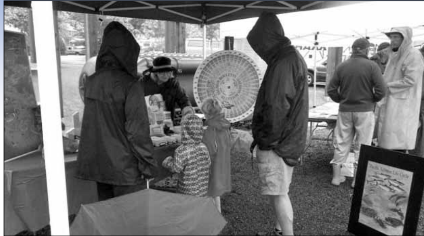
Rivers Day was appropriately wet, but that didn't stop plenty of supporters from coming out.

operation in 2005. Its purpose is to collect all the waterfront surface water, including streams potentially entering Howe Sound, and treat it to remove heavy metals and other toxins.