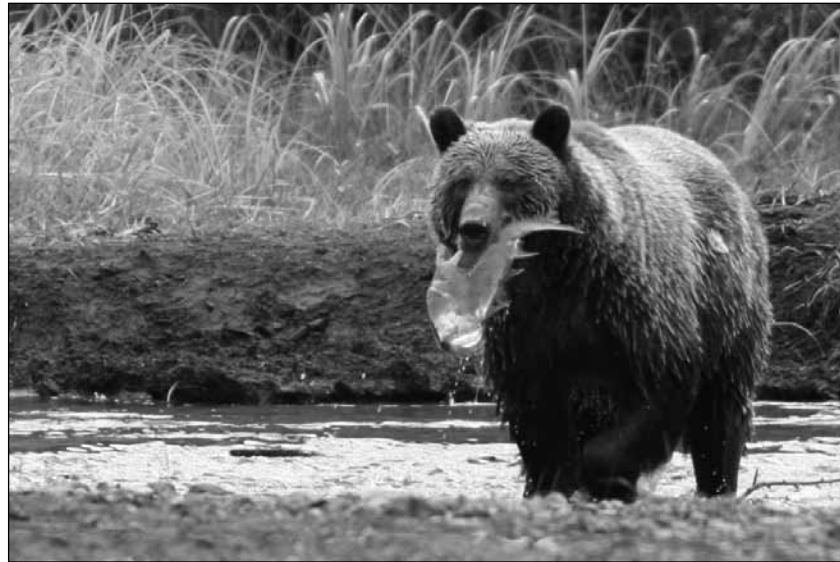
Bears and salmon need plenty of room to live out their lives and thrive. Every hectare helps.

TLC's campaign to purchase a 22-hectare parcel in the Horsefly River valley is just this type of project. We are working to acquire the last piece of the old Kroener Ranch that is immediately adjacent to the Horsefly River Riparian Conservation Area (HRRCA). This new property of young mixed-wood forest, wetlands, and intact riparian habitat is of