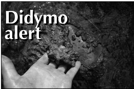
Check, clean and dry your gear to stop Didymo's spread.

Didymo ( Didymosphenia geminata ) is a large diatomaceous algae now invading freshwater systems across North America. It has been identified in the Cowichan and Somass rivers on Vancouver Island; the Bulkley River in the Skeena River watershed; the Adams, Middle Shuswap and South Thompson rivers in the Southern Interior; and the Kettle, Columbia and Kootenay rivers in southeastern B.C.