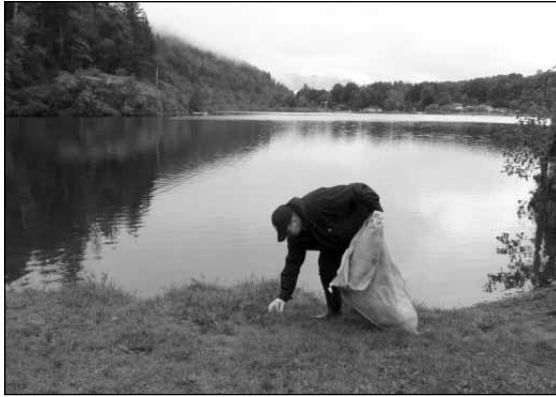
Even the smallest piece of trash is unwelcome here.

Lake Errock is a small jewel located east of Mission on the north side of the Fraser River. October 1 marked the first of five watershed stewardship