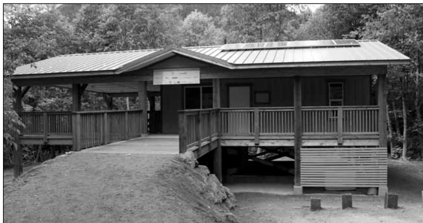
The building is completely off-grid, featuring solar power, composting toilets and rainwater catchment.

The award, for leadership and innovation, recognizes ideas that rise above challenges using vision, creativity and teamwork.