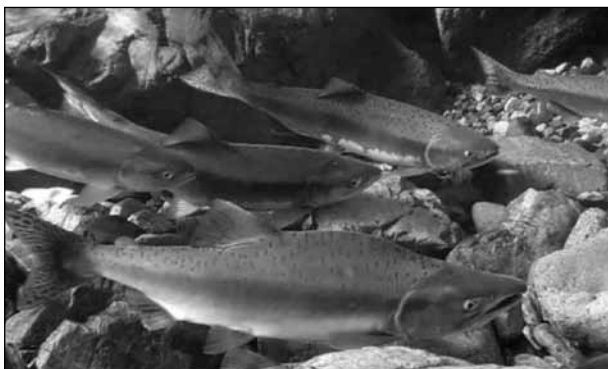
Britannia Creek's most welcome visitors.

This encouraging news follows on 30 years of environmental activism and lobbying, and 10 years of committed government- and industry-funded remediation work. In 2001, UBC engineers installed a plug in the mine to divert some of the acid runoff away from the creek, but it was still finding its way into the ocean. Government and industry then committed funds for a water treatment plant, which began