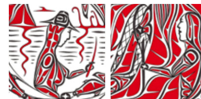
Middle + Bottom Right

PLANTS used for medicine; fertilized by salmon's bodies.