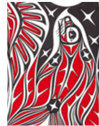
Right of Centre

SALMON feed all in their path - from the mountains to the sea. The circle depicts salmon's lifecycle; salmon travel from rivers to the ocean (feeding the orcas) and return to the rivers (feeding our forests, insects and animals).