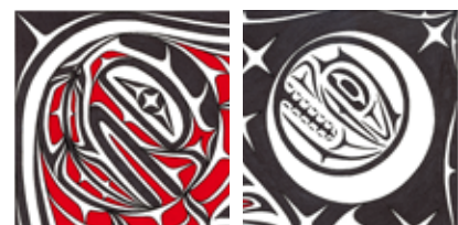
Middle + Bottom Right

HARVESTING THE SALMON is part of cultural identity, spirituality and way of life. Men and women work together to feed their children and teach the next generation through their thoughts and actions. The men are harvesting and the women are preparing the salmon.