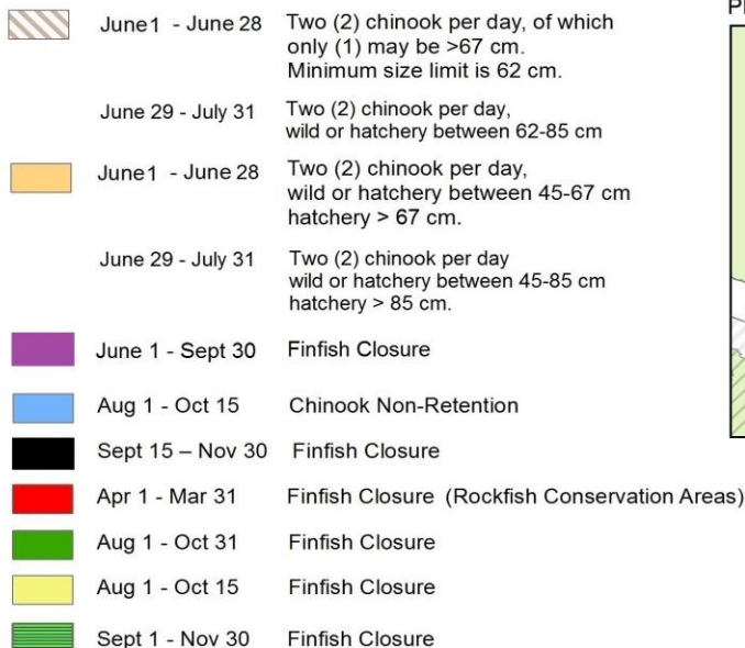
PFMA Overview Map