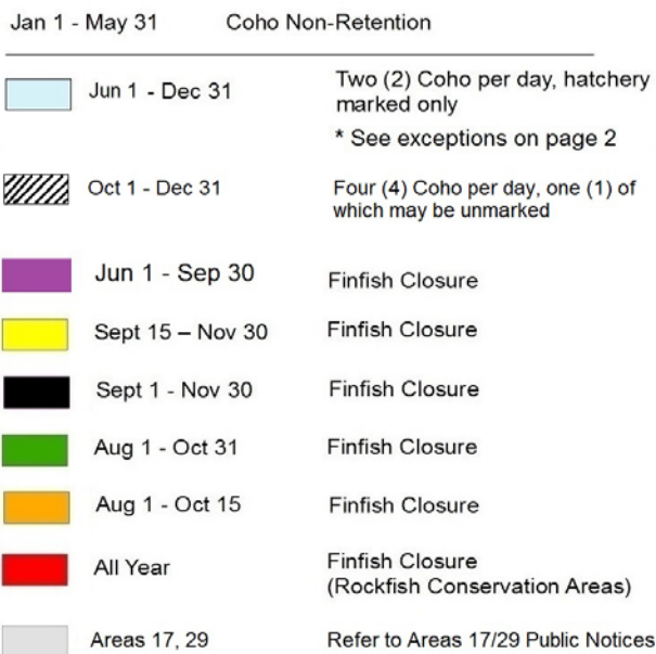
PFMA Overview Map